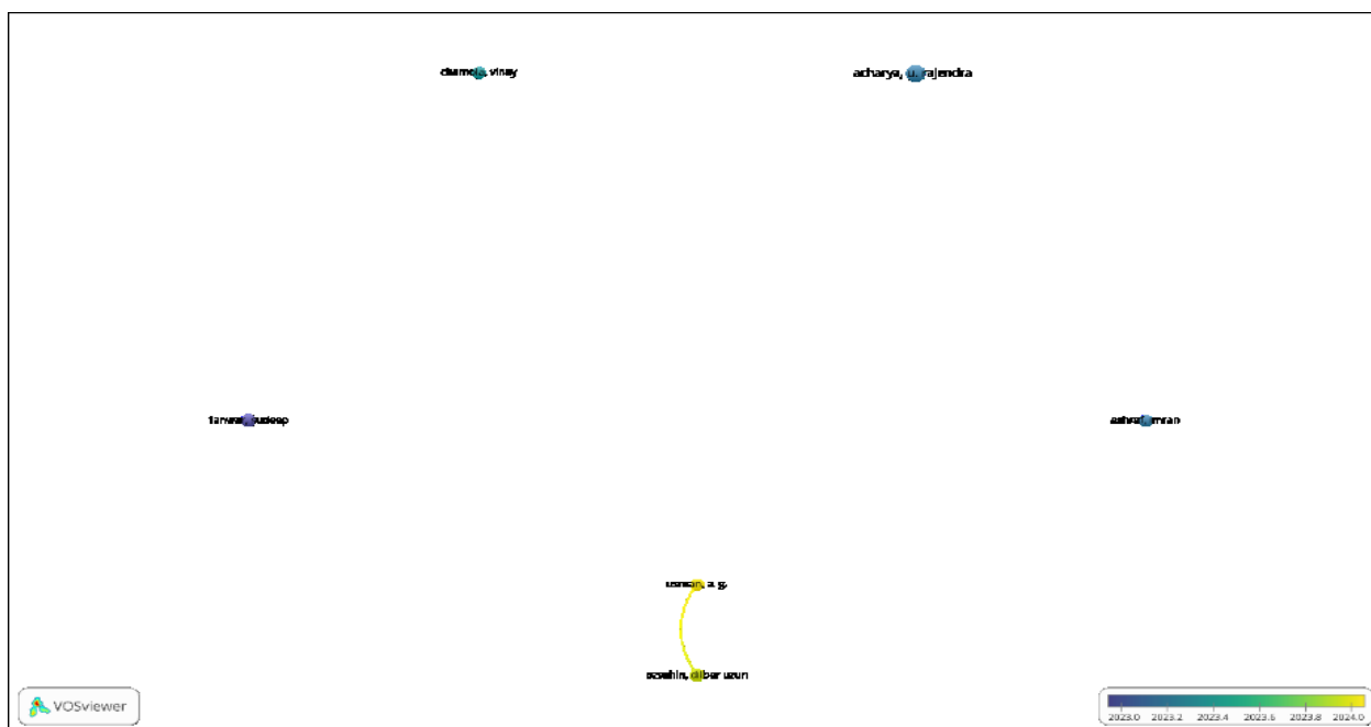
Figure 4. Author Co-Authorship Analysis

Meanwhile, the yellow and light green areas on the right and lower sides of the map indicate that countries such as Saudi Arabia, Malaysia, and Egypt have actively joined international collaboration networks in recent years and have become emerging collaboration hubs. This demonstrates that, in addition to the traditional Western-centered collaboration structures, new emerging actors are being integrated into research networks, resulting in a dynamic and globalized collaboration structure in this field.